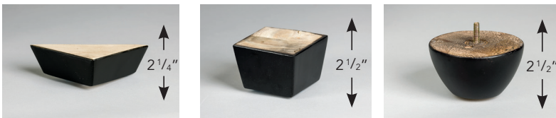
Wedge - W